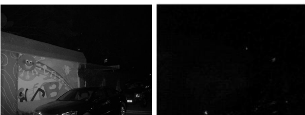
With IR light