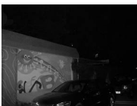
With IR light