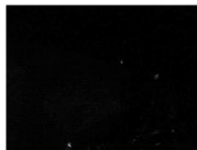
Without IR light