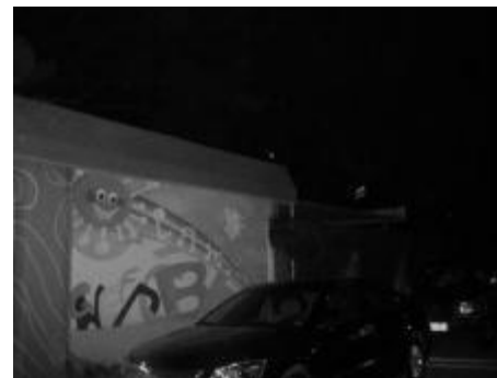
Night time with IR Light